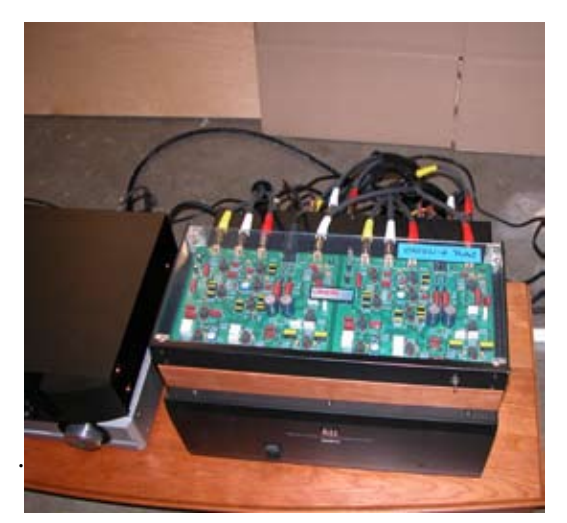
The Orion amplifier and crossover controller

The rear of the Orion speaker. There is no back. The sound comes out from both the front and back.